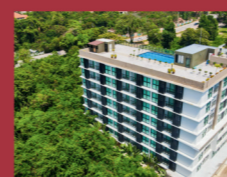
6. Garden 2 2015 | 76 units