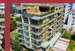
1. Condominium 2007 | 57 units

Images, renderings, and visualizations are for illustrative purposes only and may differ from the final construction. The developer reserves the right to change specifications, materials, and design without prior notice.