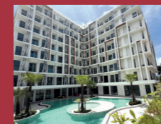
11. Dream 2025 | 188 units