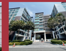
8. Tropical 2016 | 427 units