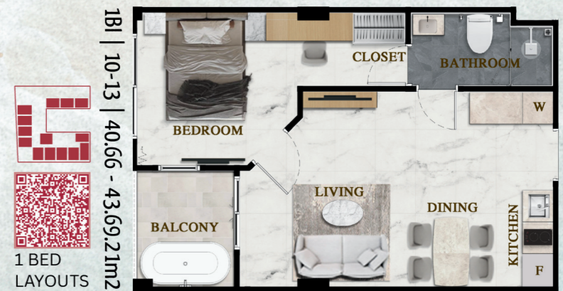
1 BED LAYOUTS