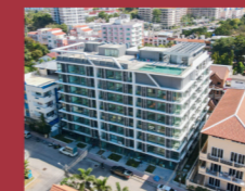
10. Star 2021 | 142 units