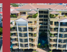
2. Twins 2010 | 78 units