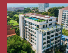
4. Elegance 2013 | 79 units