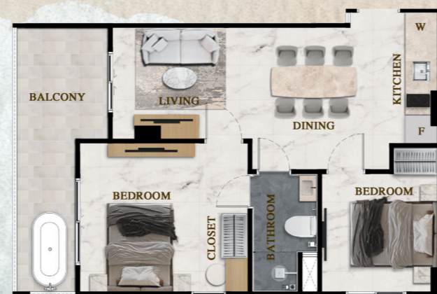
2BB | 14 | 58.96m2

Carefully designed smell-lock connections in toilets and floor drains help prevent unpleasant odors from entering the apartment, keeping the indoor air fresh.