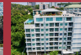
7. Garden 3 2016 | 79 units