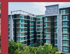
9. Plaza 2017 | 190 units