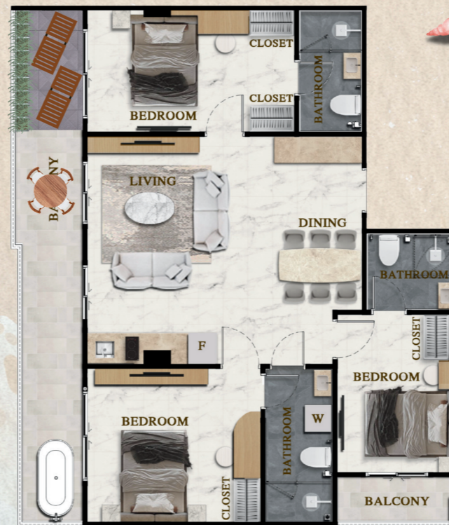
3BD | 13+14 | 100.67m2