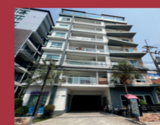
5. Elegance 2 2015 | 79 units