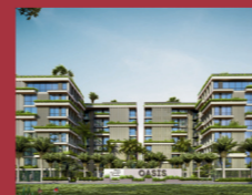
12. Oasis 2027 | 377 units